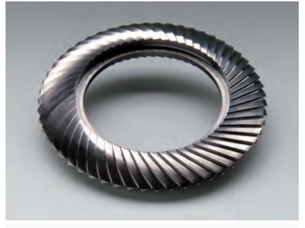
Weld root opener 116 mm for aluminum

Chips are produced instead of dust. This is a significant contribution to work safety. The explosion hazard caused from aluminum dust is eliminated.