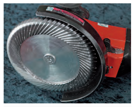
Frontal view of an angle grinder with a milling disc

The milling rings are used for bevelling, smoothing general welds and scrubbing, while the double-sided milling disc is used to open butt- and fillet welds. Especially with aluminium there is no smearing of the material, thereby welding defects are visible immediately. The workpiece remains largely cold and residuals of abrasives are avoided. Thus, the weld quality improves significantly. As residues remain solely chips, work safety is improved and explosion hazards from aluminium dust are avoided.