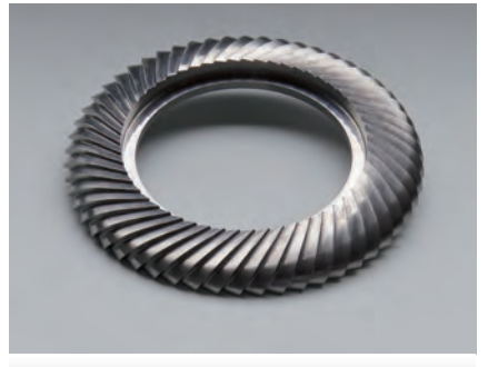
Milling ring 116 mm for aluminum

These are also available in diameters of 70, 116 and 125 mm and are used for opening of butt- or fillet welds. Suitable materials are all non-ferrous metals, carbon / fiberglass, plastics and wood.