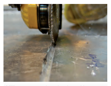
Milling a root gap by using the weld root opener

The milling rings are used for bevelling, smoothing general welds and scrubbing, while the double-sided milling disc is used to open butt- and fillet welds. Especially with aluminium there is no smearing of the material, thereby welding defects are visible immediately. The workpiece remains largely cold and residuals of abrasives are avoided. Thus, the weld quality improves significantly. As residues remain solely chips, work safety is improved and explosion hazards from aluminium dust are avoided.