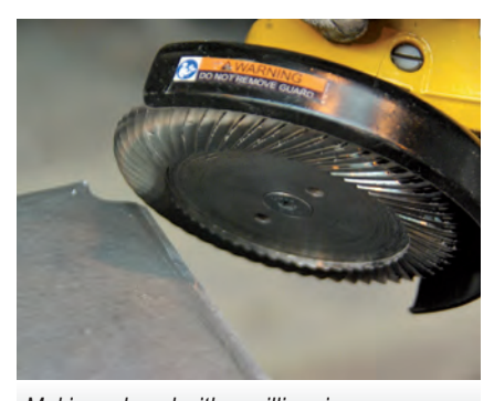
Making a bevel with a milling ring

The tools can be used with commercially available electrically or pneumatically operated hand angle grinders with a speed of 12,000 rev / min and are available in diameters of 70, 116 and 125 mm. Metals such as aluminum, titanium, copper, brass and bronze, as well as plastics, CFRP / GRP and wood can be effectively processed.