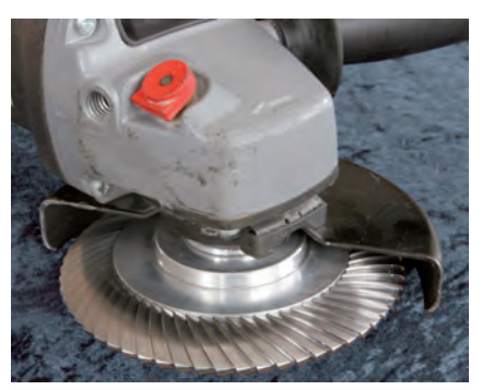
Rear view of an angle grinder with a weld root opener

The removal rate is significantly increased, grinding dust disappears and it does not retain any abrasive residues in the material. The life of a milling ring approximately corresponds to the use of 5,000 conventional grinding discs. Just the resulting savings from disk changing amortize the tool several times. The increase in efficiency and the savings in abrasives cut costs by orders of magnitude.