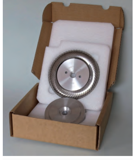
Milling ring set: Consisting of the milling ring, the reusable transport box, the base support and the retainer nut

With a base support M 14 the milling rings may be mounted to many angle grinder with a M 14 thread not requiring an additional mounting flange.